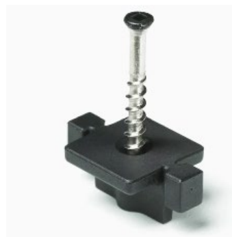
Figure 3: Stowaway