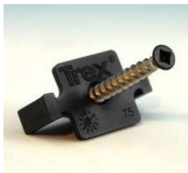
Figure 2: Trex