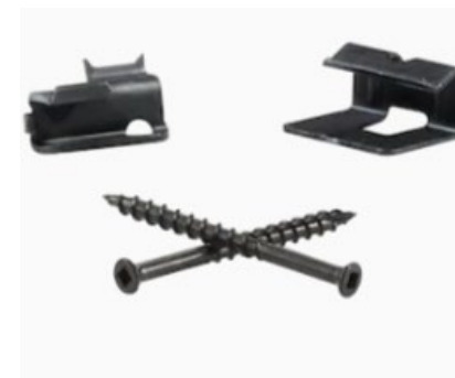
Figure 4: VersaClip