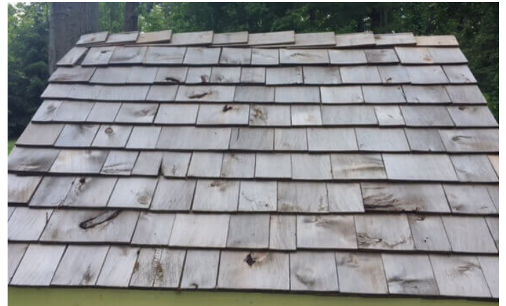
#4 Undercourse Shingles

Designed to be a starter layer to build your shingle or shake roof on.