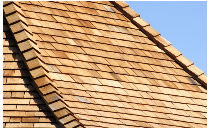
Hip & Ridge

24" Long, uniform tapersawn works for both shingle or shake roof.