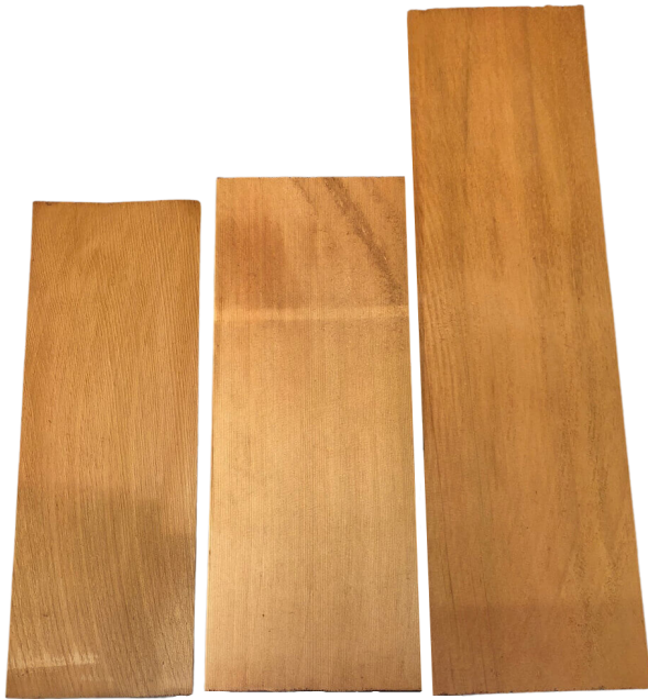
16" #1 Blue "Five X"