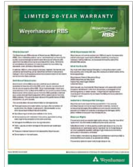
Visit woodbywy.com/warranty for copies of this and other Weyerhaeuser product warranties.

4' x 8' Weyerhaeuser RBS panels are available in three thicknesses: 7/16", 15/32", and 19/32".