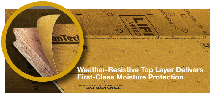
Weather-Resistive Top Layer Delivers First-Class Moisture Protection

The built-in, water-shedding top layer provides a distinctively smooth, even, premium subfloor surface that is marker friendly and easy to clean.